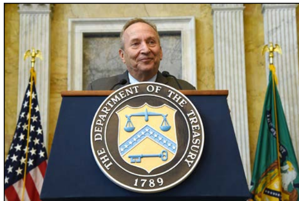
Former Secretary Summers, above, and Former Secretary Paulson, right, each provided to THA members and their guests an insight into the Secretaries' reminiscences of their terms of office at the Department of the Treasury (from 1999 to 2001 and from 2006 to 2009, respectively).

The capstones of the two year's noontime lecture presentations were "Reminiscences of My Time as Secretary of the Treasury," by former Secretaries Henry M. Paulson, Jr. and Lawrence H. Summers, presented in December 2014 and November 2015, respectively.